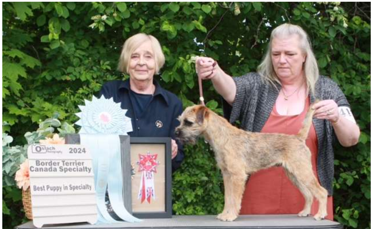
Best Puppy in Specialty and Reserve Winners Dog