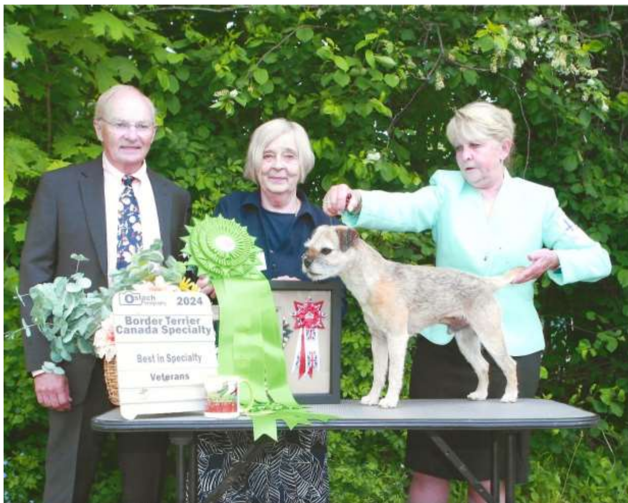
Best Veteran in Specialty

Lovely 13-year-old boy who still had amazing reach and drive on the move. Lovely head with dark eye and correct bite. Was a joy to see him still enjoying his showing.