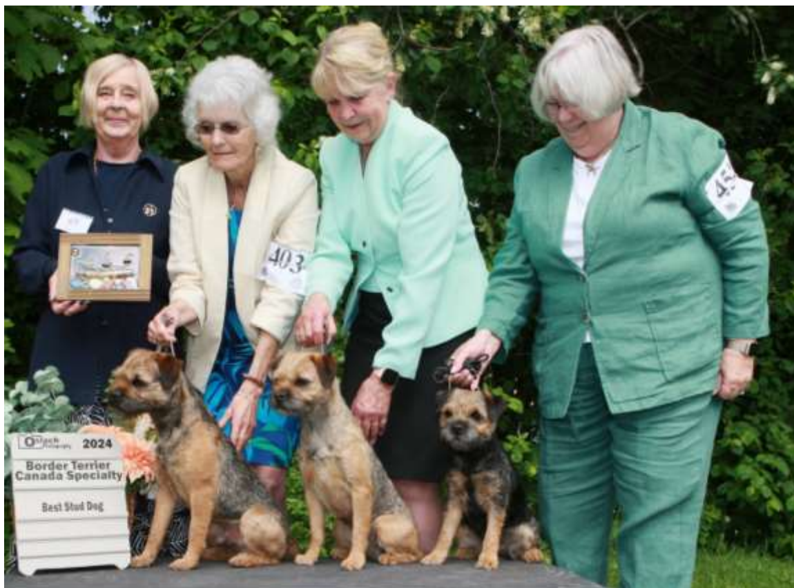
Best Stud Dog