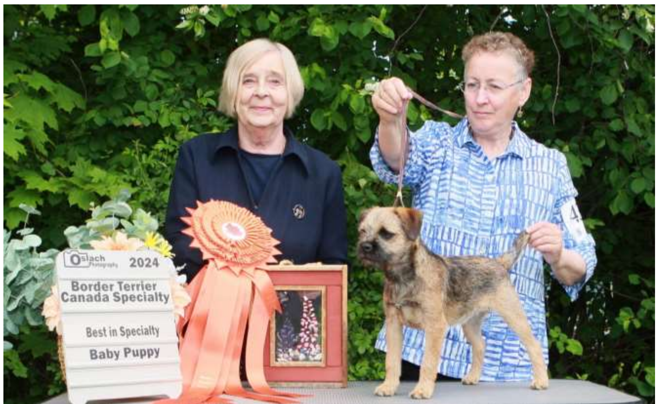
Best Baby Puppy in Specialty