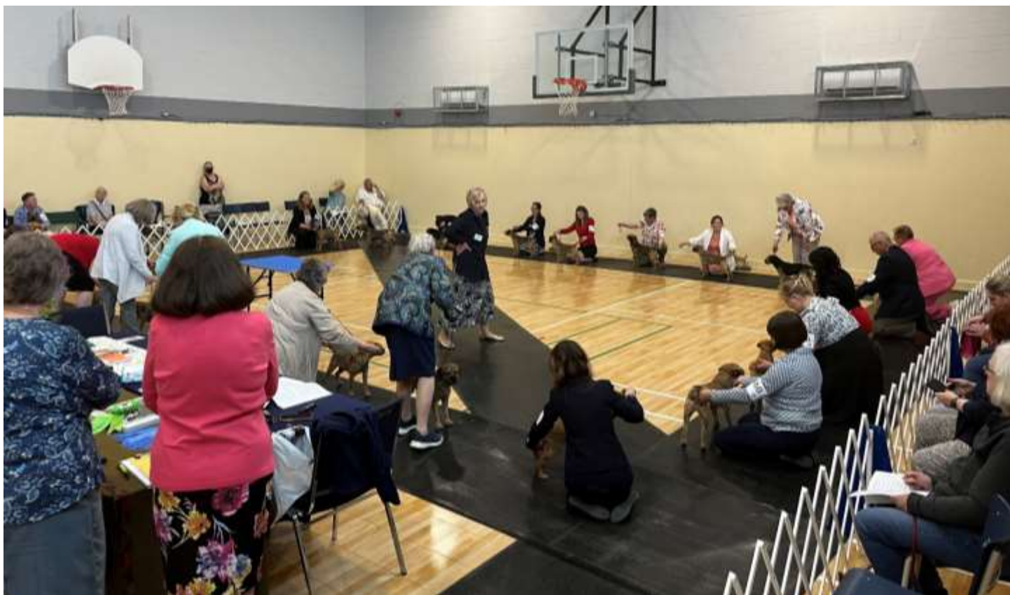
Impressive Best of Breed Lineup

Good type with nice head and expression, correct bite lost out to 1 as ribs a little sprung.