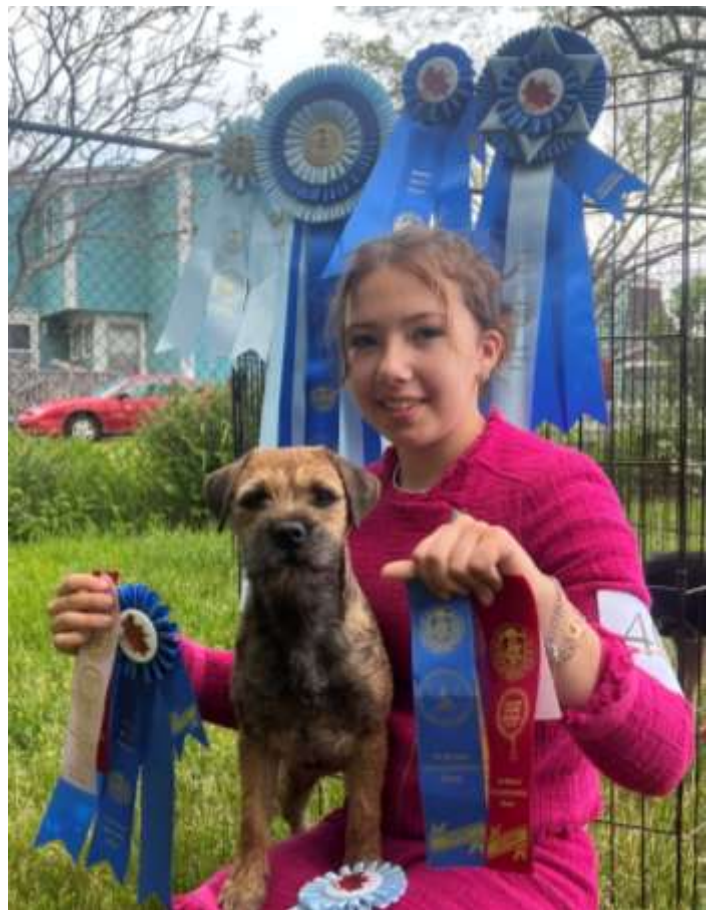
Best Junior Handler