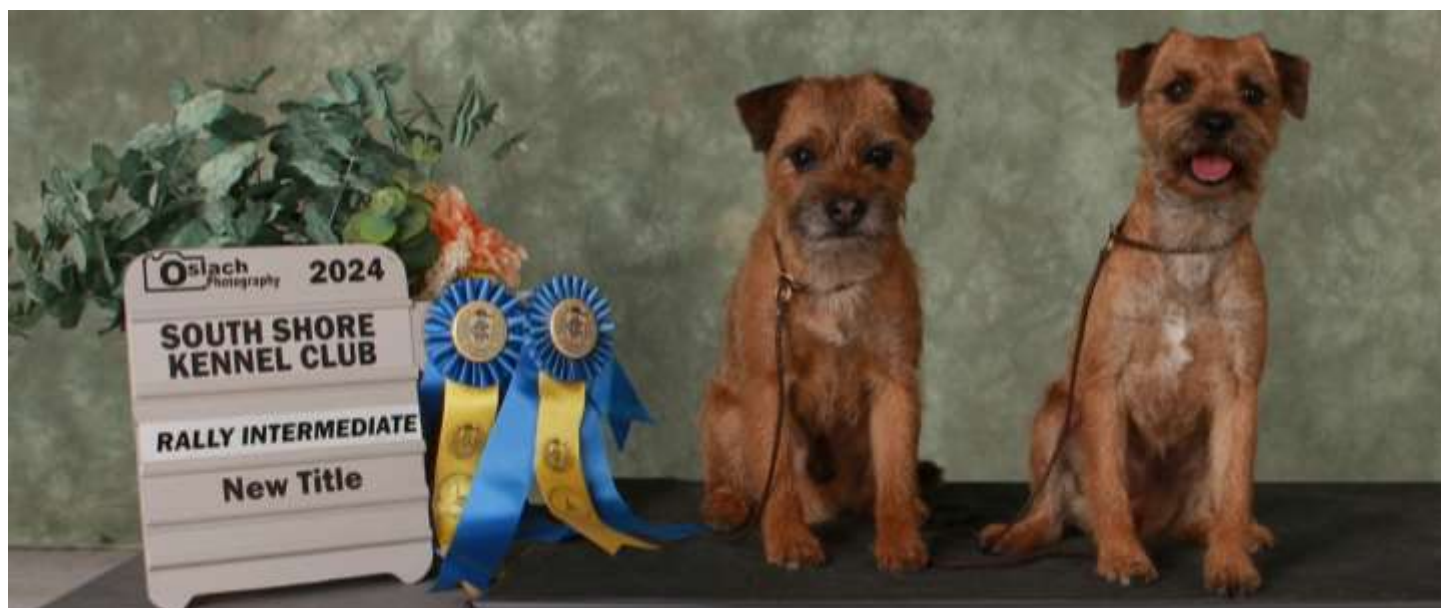
Digger and Pickles