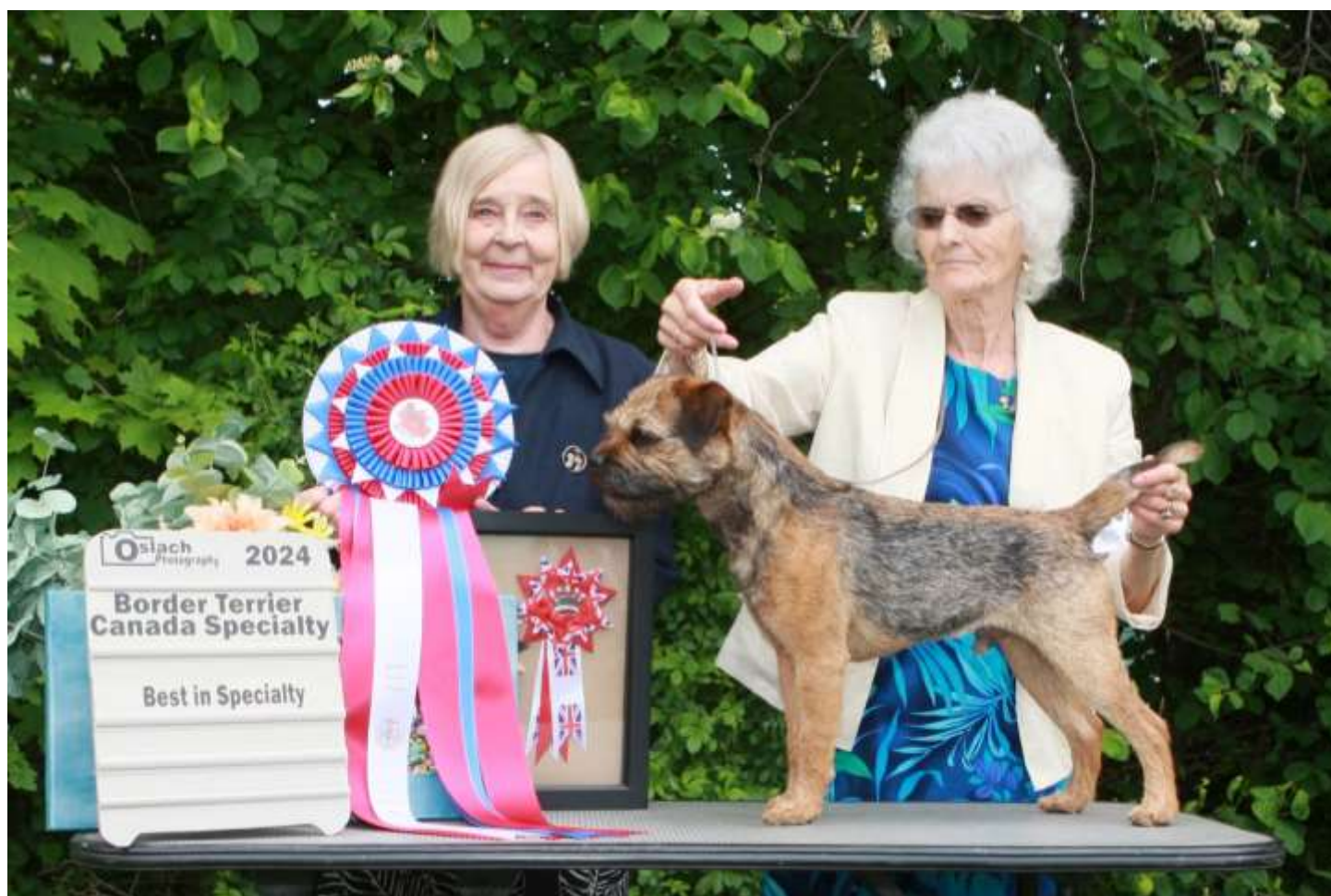
Best of Breed

Delighted to award this bitch Best of Opposite Specialty. She is a very strong headed but feminine bitch, with a wonderful front and rear assembly giving her very true and sound movement. Correct bite, with good size teeth. Hard coat with thick pelt. Elegant with strength is what I thought on seeing her and going over her I found exactly that with good bone and feet, although easily spanned she was maybe slightly bigger than I personally like in a bitch, but all her other qualities made that unimportant.