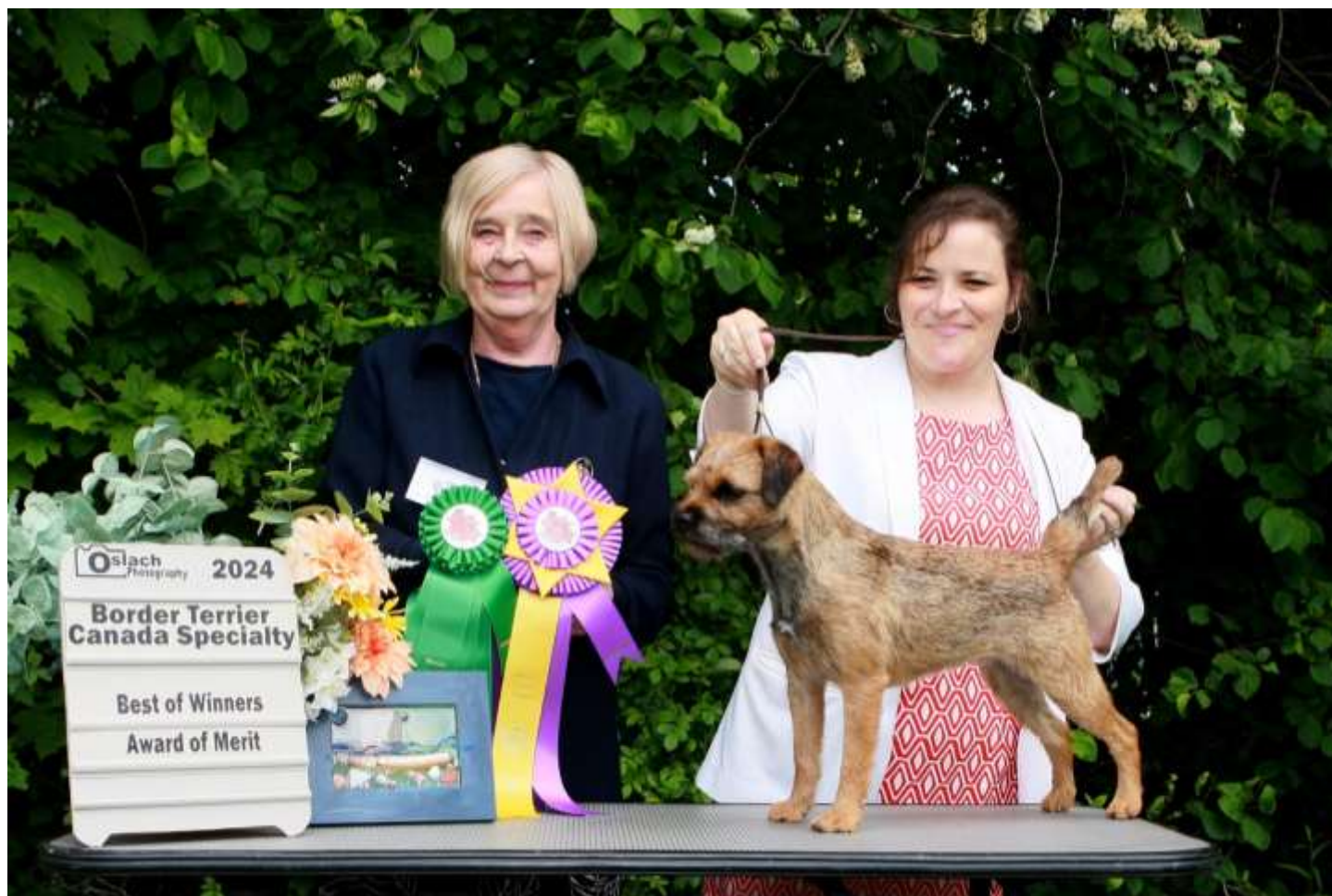
Winners Bitch, Best of Winners