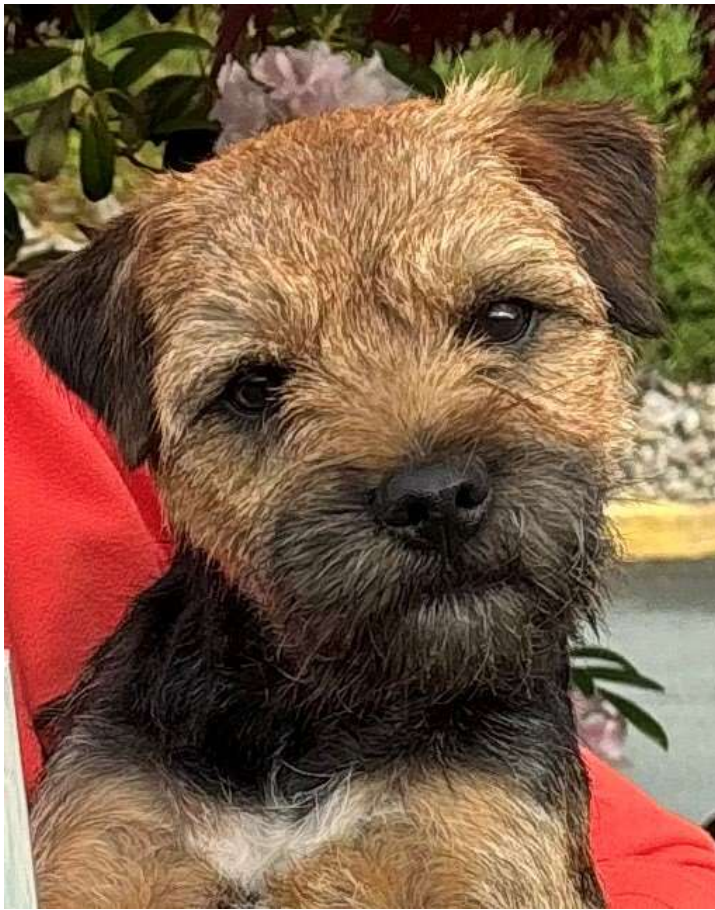
Best Otter Head