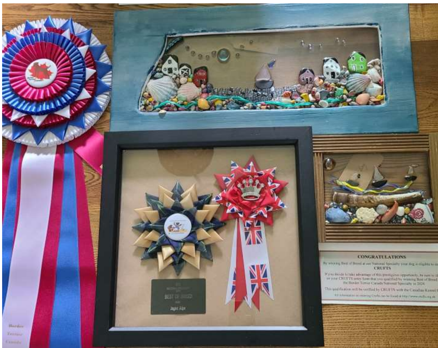
The stunning Best of Breed Prizes