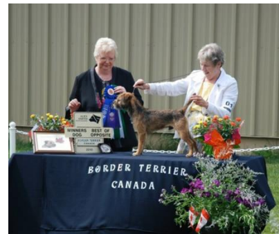
Best of Opposite Sex, Winners Male - Towzie Tyke Tartan