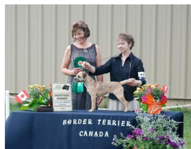
Best in Puppy Sweeps, Best Puppy, Reserve Winners Bitch - Duets About Last Night