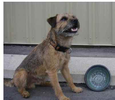
Molly award - winners dog