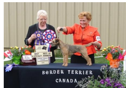
Best of Breed, Best of Winners, Winners Bitch - Roschel's Mariah