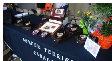
A trophy table to be proud of