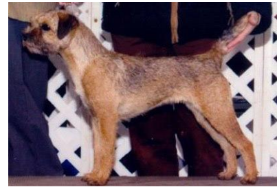
Best Veteran in Sweeps, Best Veteran Female - Ch Talex Good Thyme Gal JE