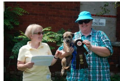
Worth waiting for