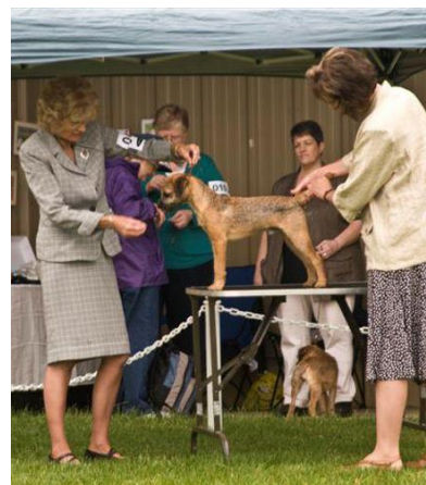
Best of Opposite Sex in Puppy Sweeps - Foxrun Bangers N. Mash