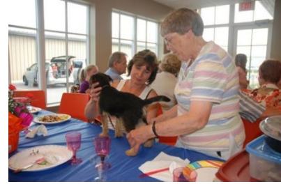
Where else would a pup be welcome on the table