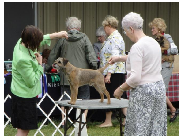
Veteran dog has his own perspective