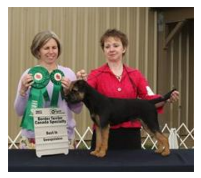
BEST OF OPPOSITE IN SWEEPSTAKES – Fairview Double Back to Bandersnatch