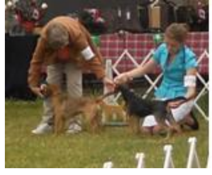
and two Senior Puppy Females