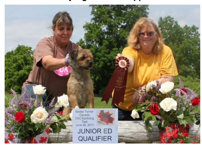
Mchenry's Ewok Of Endor