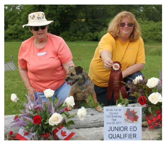
Meadowlake Van Gogh