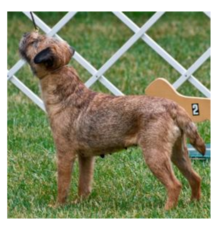
VETERAN FEMALE - Ch. Foxrun Clove R, JE