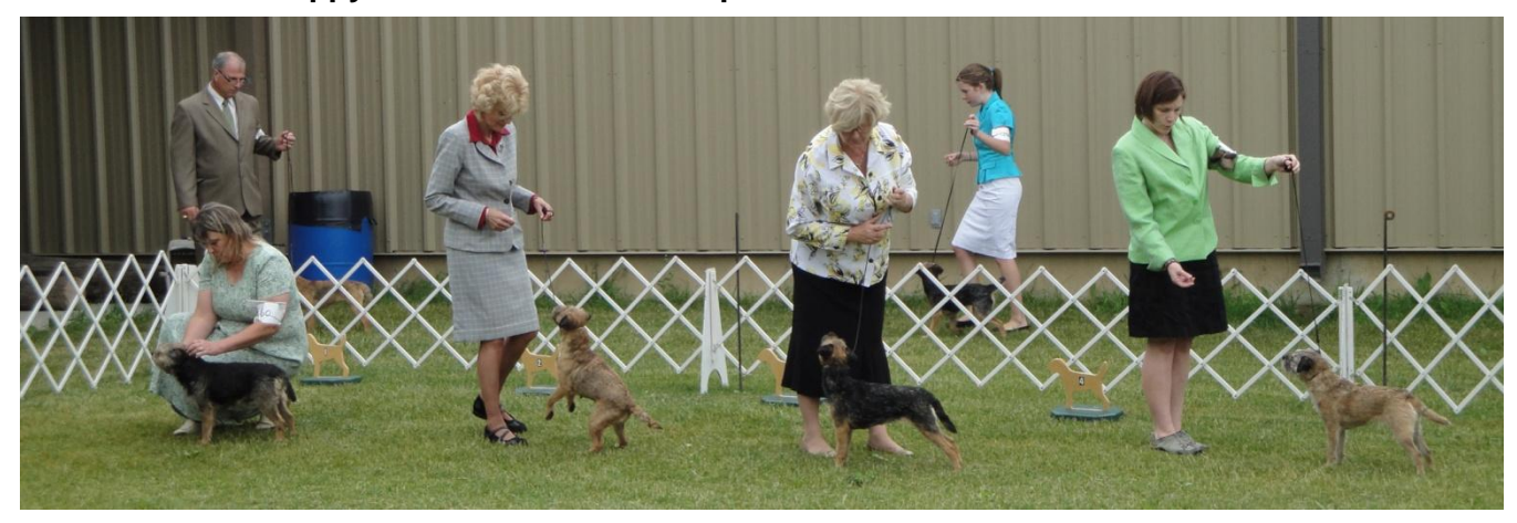
Veteran bitch competition