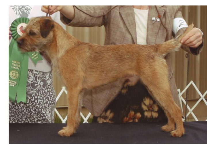
VETERAN MALE – CH Lothlorien Coniston JE