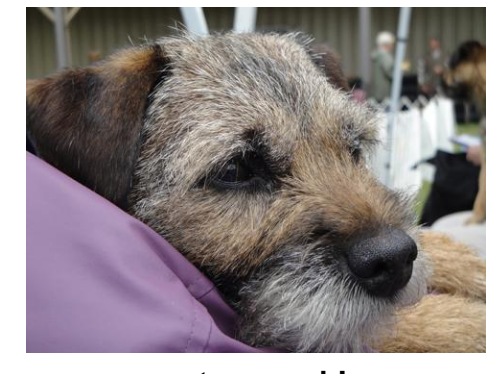
...not so much!