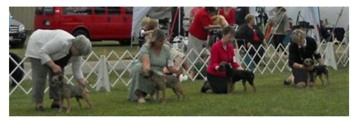
Dog Class Winners competing for Winners Dog