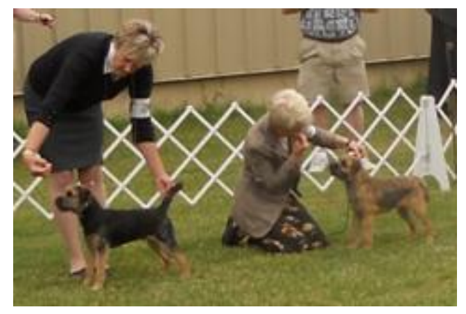
Two of the Junior Puppy Dogs