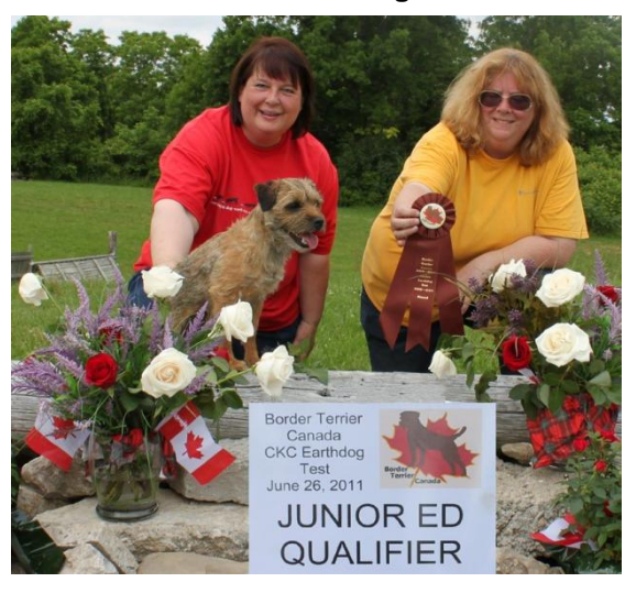
Ch. Thistlebitt Gleniffer Braes